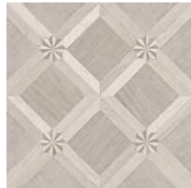
TF50P3 50x50 Palazzo Pitti Grigio