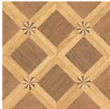
TF50P4 50x50 Palazzo Pitti Noce