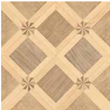
TF50P2 50x50 Palazzo Pitti Rovere